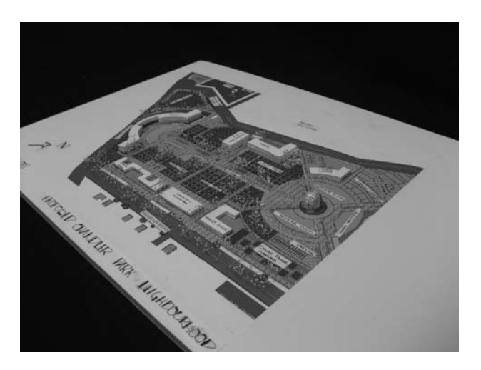
Figure 3: Master Plan Example

(B) An open space model is proposed for East Warren's well known golf course area (Sector 2). This open space district is currently underutilized but has strong potential for urban farming. This model promotes high intensity urban farming with range