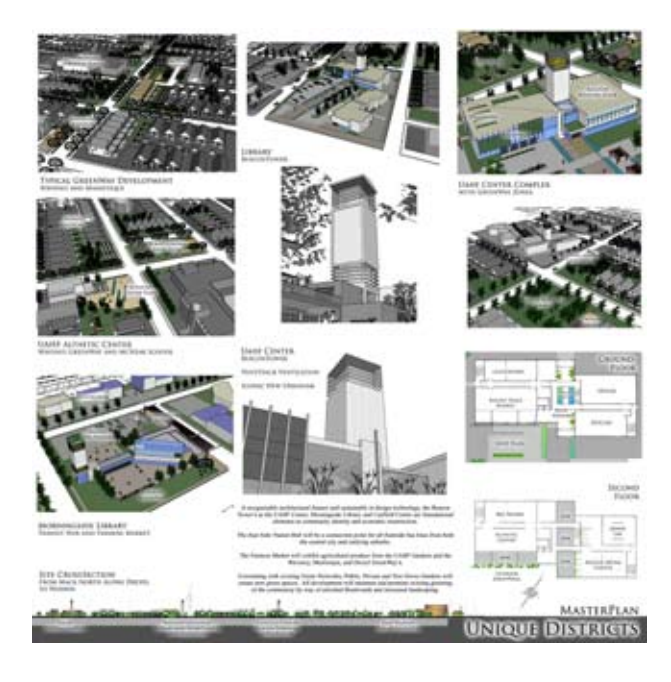
Figure 4: Master Plan Details Example

(C) A corridor model is applied to the East Warren Street corridor (Sector 3), which has few open spaces and consists predominantly of two-story and three-story retail buildings, many of which are underutilized or vacant. The road is very wide and busy, making crossing and walking unsafe. This model seeks a balanced combination of diverse developments like agriculture research facilities near the existing hospitals or schools as well as community gardens or farms that also function as open spaces; mixed use buildings; and boulevards as traffic calming strategies along the corridor.