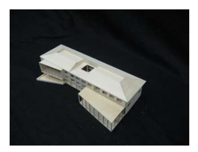
Figure 2: UAHF Lifestyle Center Example

sources and interviews with planning officials and community agencies suggest that agriculture offers a range of opportunities for cleaning up the vacant land, putting it to productive use through gardens or micro farms, creating an income source and providing aesthetic improvement for the neighborhood. As more funding becomes available, some of these gardens could develop into larger commercial forms of agriculture like greenhouses or industrial agriculture parks. While community gardens or micro farms can act as physical design strategies to promote a visually pleasing and pedestrianfriendly environment, some of them can be easily developed into infill housing or other neighborhood service facilities in later phases.